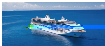
Cruise and Cargo Ships