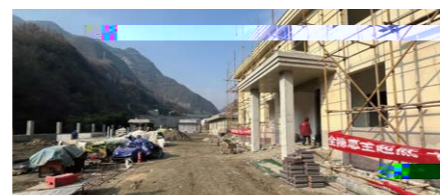
Water Plant Expansion & Upgrades