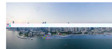
Large-scale Island Desalination