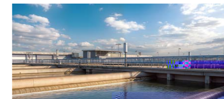
Municipal Water Supply