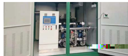
Temporary Water Supply