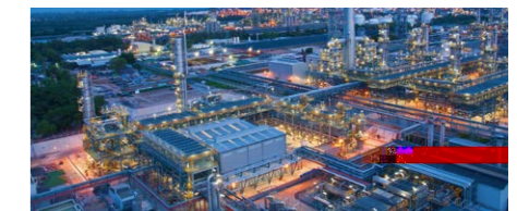
Industrial Park Process Water