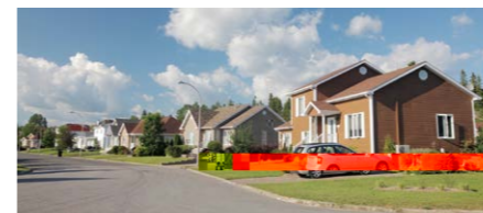
Township & Rural Water Supply