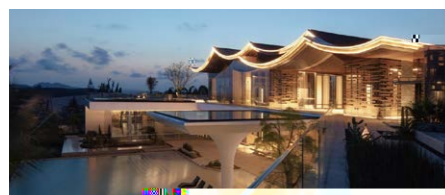
Hotels & Resorts