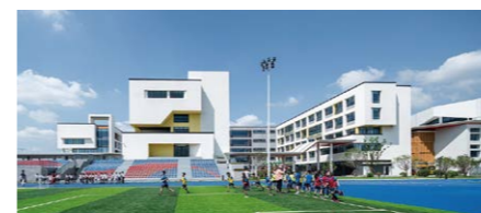
Institutional & Commercial Zones