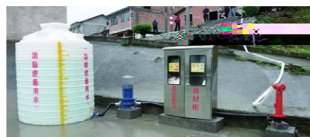
Emergency & Disaster Relief